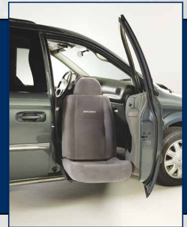
TURNING AUTOMOTIVE SEATING™ (TAS™)