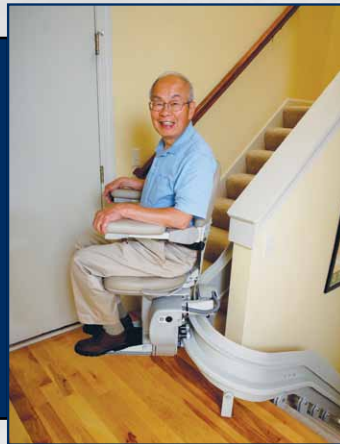
ELECTRA-RIDE™ III Model CRE-2110