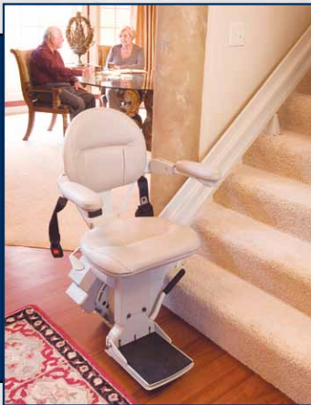
ELECTRA-RIDE™ ELITE Model SRE-2010

Home accessibility solutions and automotive products